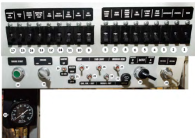
Figure 4-10. Instrument Panel – Standard Equipment Locations